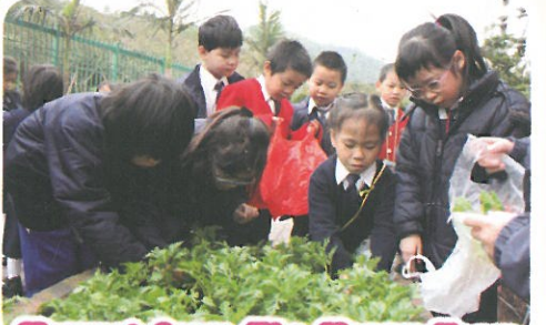
Harvest from The Happy Farm