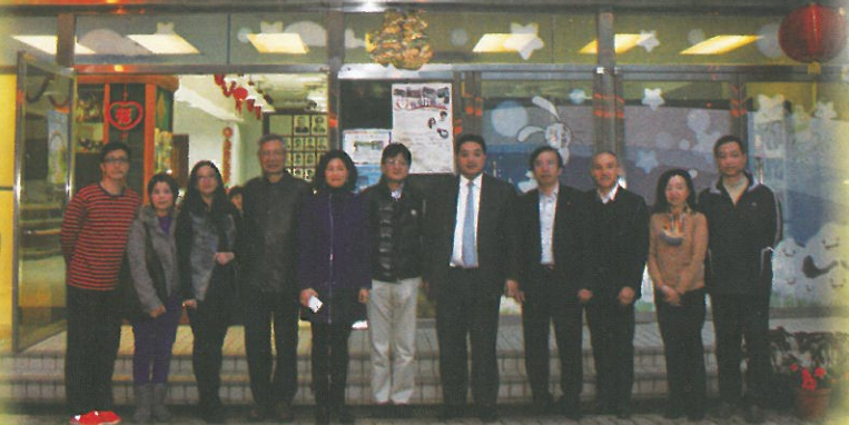
The School Board Managers