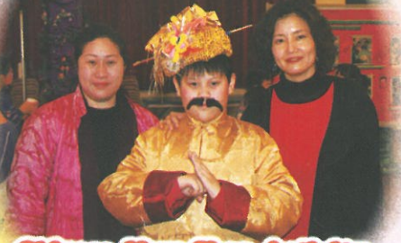
Chinese New Year Activity