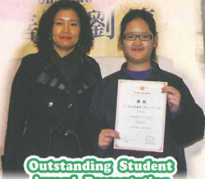
Outstanding Student Award Presentation