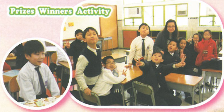
Prizes Winners Activity