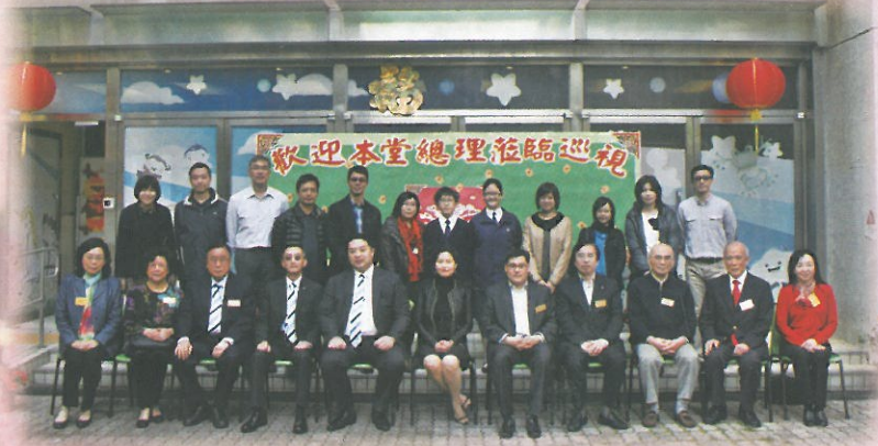
The Presidents of LST came for a Visit