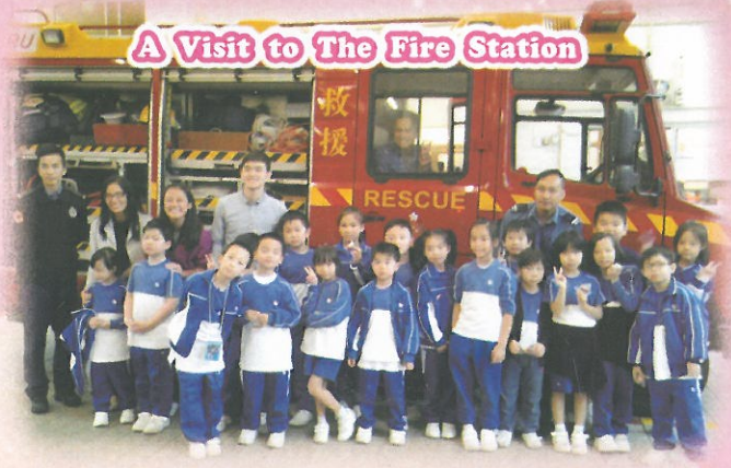
A Visit to The Fire Station