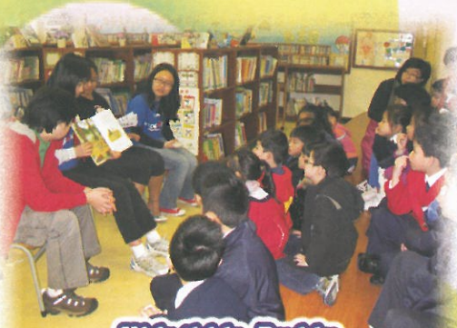
Kids4kids Buddy Reading Programme