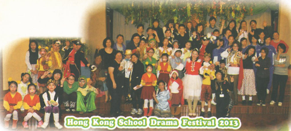
Hong Kong School Drama Festival 2013