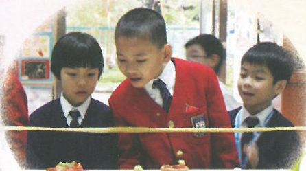
Visual Arts Exhibition