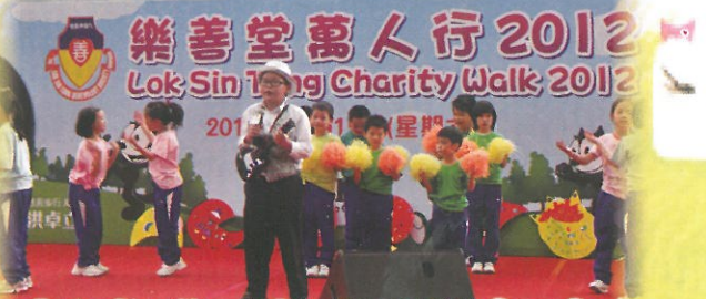
Lok Sin Tong Charity Walk (2012)