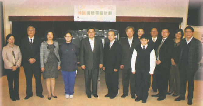
Computers Donation by LINK