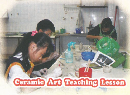
Ceramic Art Teaching Lesson