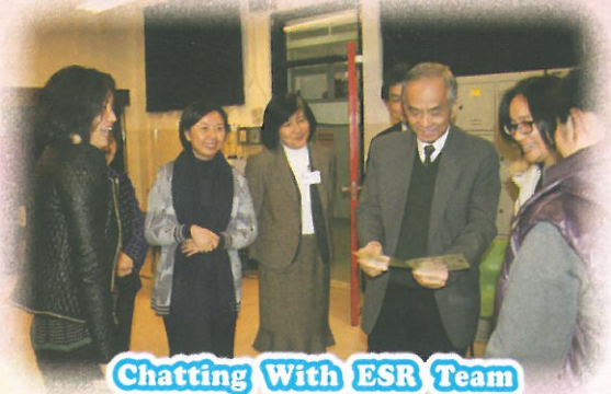
Chatting With ESR Team