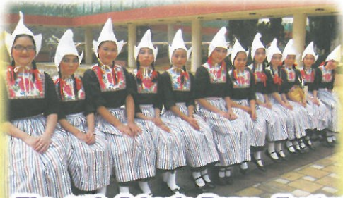
The 49th Schools Dance Festival Award for the Outstanding Performance