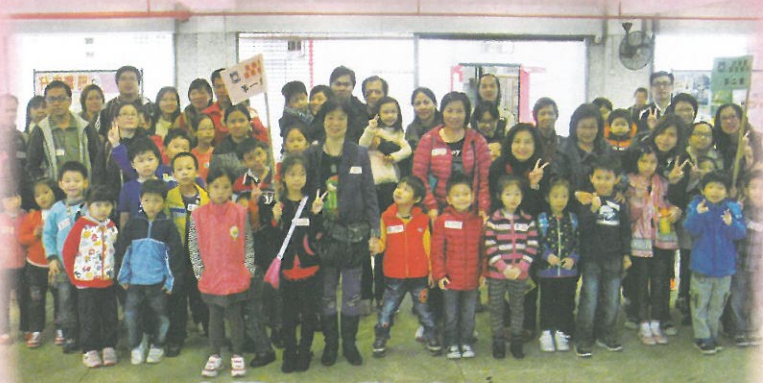
A Visit to The Cyberport